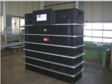
Drinking water Tank