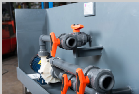
Acid tank with circulation pump