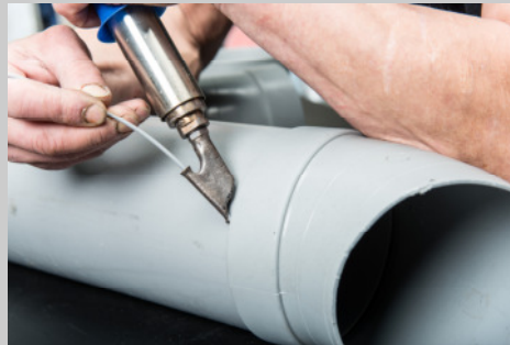
Hot gas welding