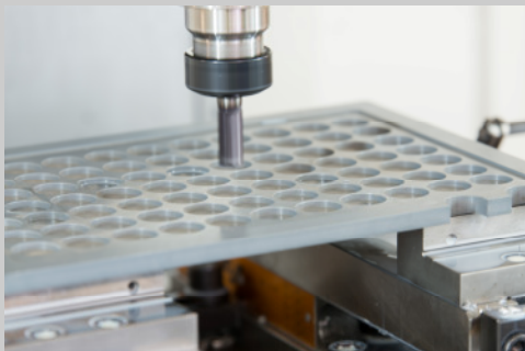
Turned and milled parts