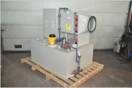
Exhaust gas scrubber