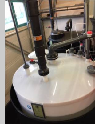
Storage Tank for sulfuric acid in PVDF